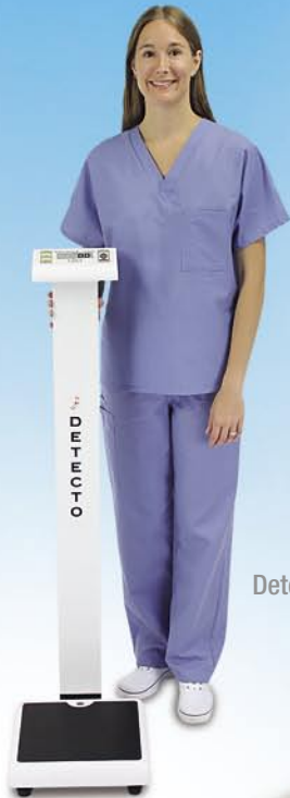
Detecto Model PD300

MEDICAL GRADE ACCURACY: WEIGHT • HEIGHT • BMI