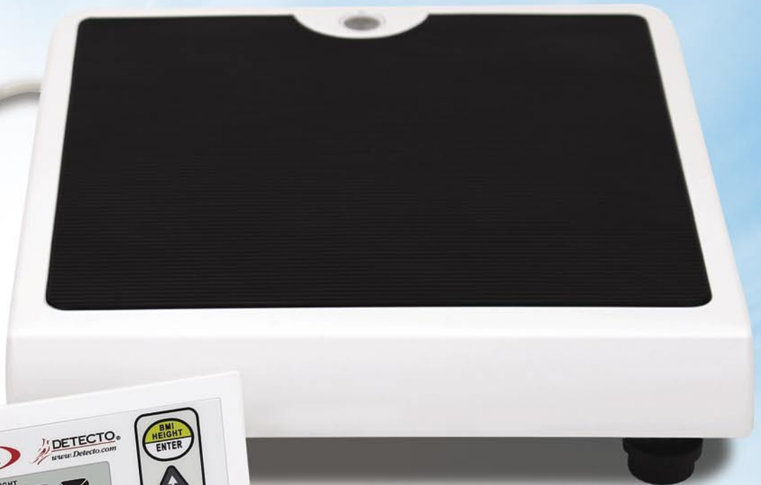
Detecto Model PD100 Low-Profile Physician Scale with Body Mass Index