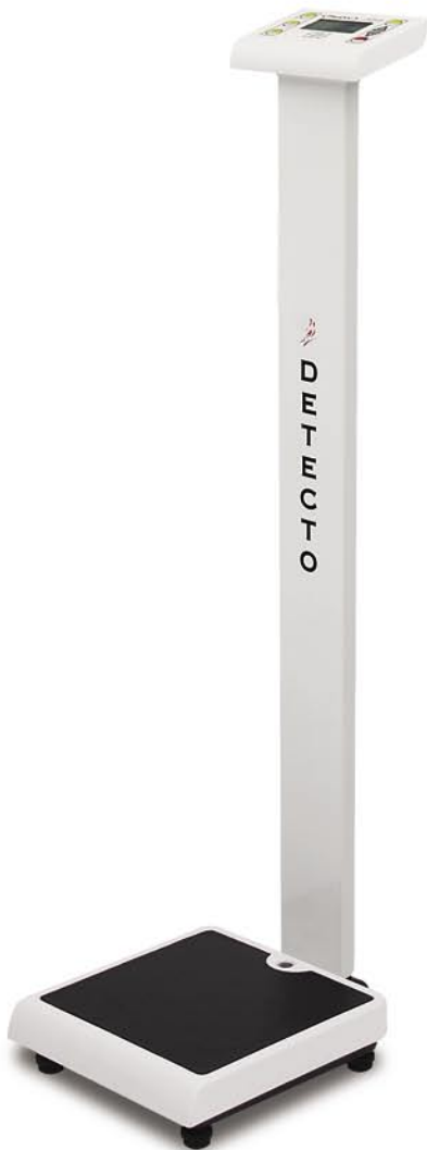
Model PD300 Eye-Level Physician Scale with Body Mass Index

The optional P50 direct thermal printer may be mounted on any of the ProDoc® PD300 series eye-level physician scales to print Time, Date, Height, Weight, and Body Mass Index. The P50 features two-button operation and RS-232 serial communication with the scale (cable included with printer).